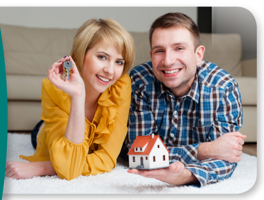
READY TO TACKLE YOUR DREAMS?